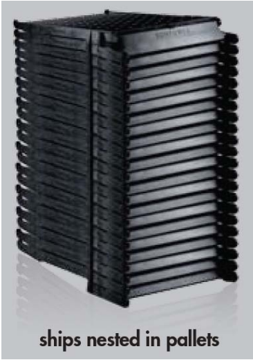
ships nested in pallets