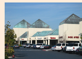
Municipalities may need to require controls on copper roofs