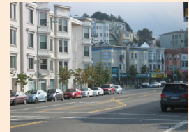
Californians hit the brakes billions of times each year

SB 346 requires that brake pads sold in California contain no more than 5% copper by weight by 2021, and no more than 0.5% by 2025. According to a representative industry analysis, as of 2006 brake pads contained an average of about 8% copper by weight. The law also limits dangerous—but fortunately less common—brake pad pollutants, by prohibiting sale of brake pads containing more than trace amounts of lead, mercury, asbestos, cadmium, and hexavalent chromium in 2014. To avoid replacing one environmental problem with another, SB 346 requires manufacturers to examine new formulations carefully and to select alternatives that pose less potential hazard to public health and the environment. Consumer safety will be ensured through a limited deadline extension process (available starting only when