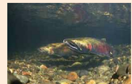
Copper disrupts salmonids' sensory capabilities, making it difficult for them to avoid predators or find their way back to their spawning grounds