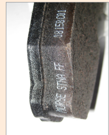
Copper content markings should be similar to these current brake pad "edge codes"

CASQA's goal is for the market to shift quickly to brakes with <0.5% copper, the level essential for compliance.