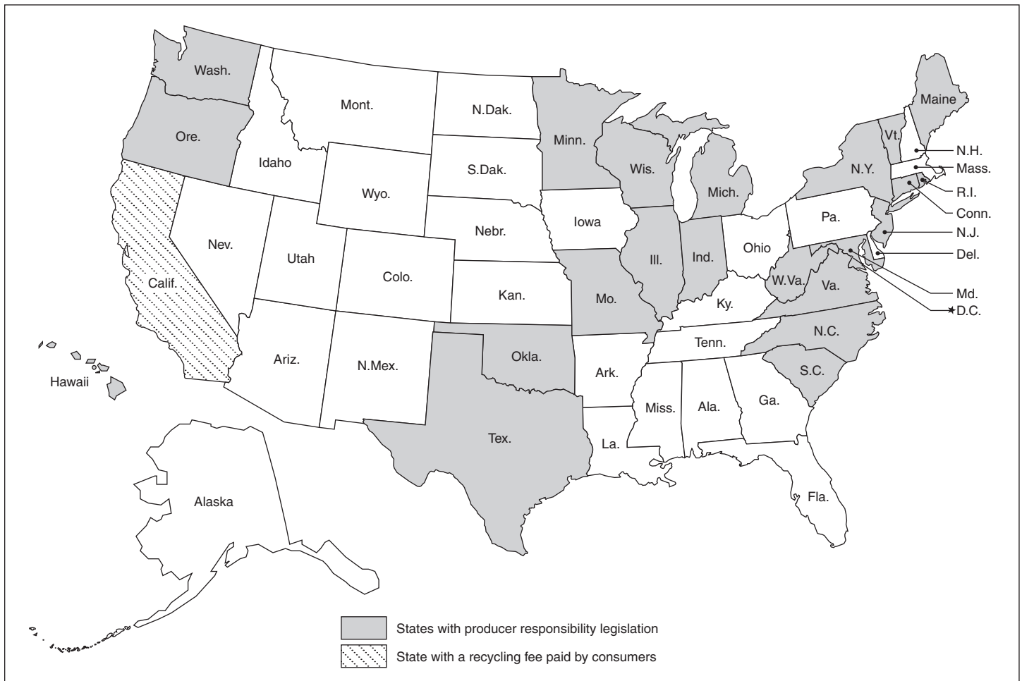
Figure 1: States with Electronics Recycling Legislation