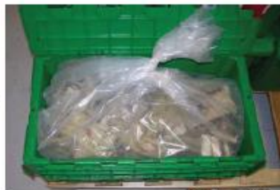
Bin received at the TRC