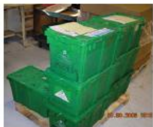
Bins ready to send to Collection Points (HHW, Contractor or Distributor)