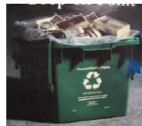
Thermostats collected and ready to be sent to the TRC