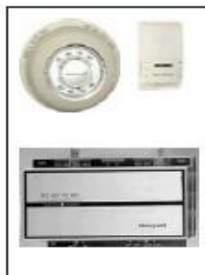
Examples of thermostats with Hg