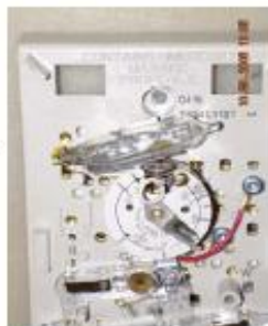
Thermostat received and ready for Hg ampoule removal