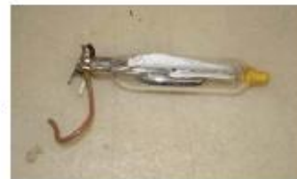
Ampoule with Hg removed from T'stat