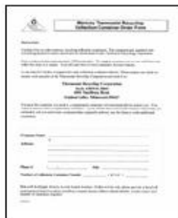
Recycling bin order form