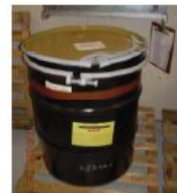
Barrel of Ampoules ready to be sent to recycler