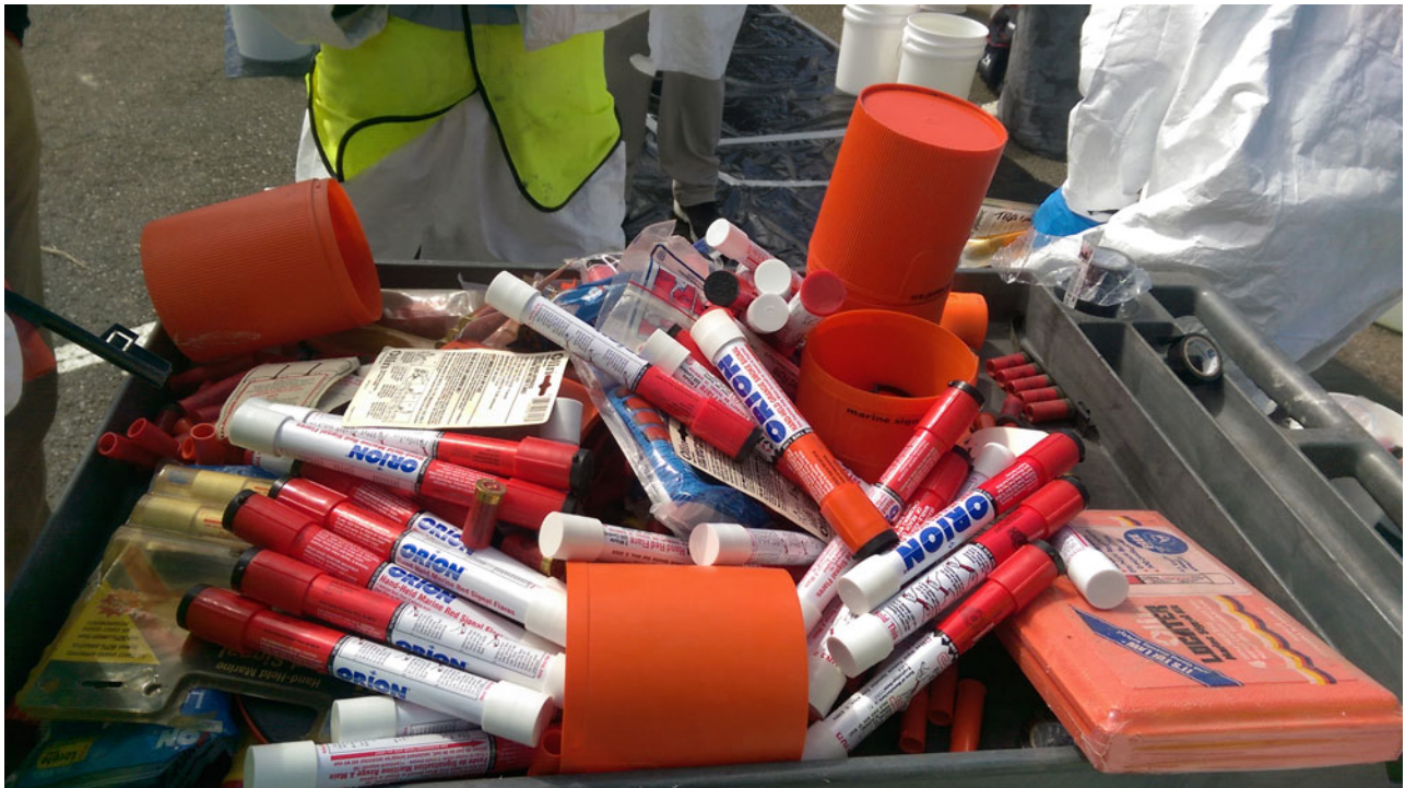
What to do with old marine flares? Put the collection dates on your calendar.

“The United States Coast Guard (USGC) requires boaters to carry several unexpired visual distress signals on board, day and night. Pyrotechnic marine flares are a common type of distress signal, but they are explosive hazardous waste and contain toxic chemicals, like perchlorate, that pose human health risks. Marine flares only work once and expire 36 to 42 months after the manufacture date.”