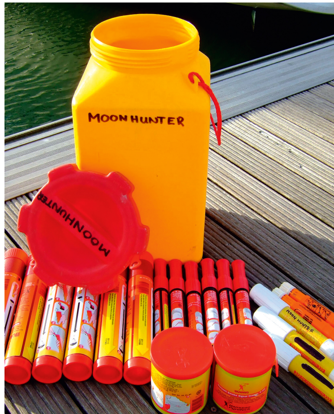
Boat flares laid out for the ARC safety inspection.

Flares are waterproof; indeed you cannot put a flare out using water if a person is injured. This may make the injury worse. Flares need to be kept readily available, but do you really want young children to find them and set them off?