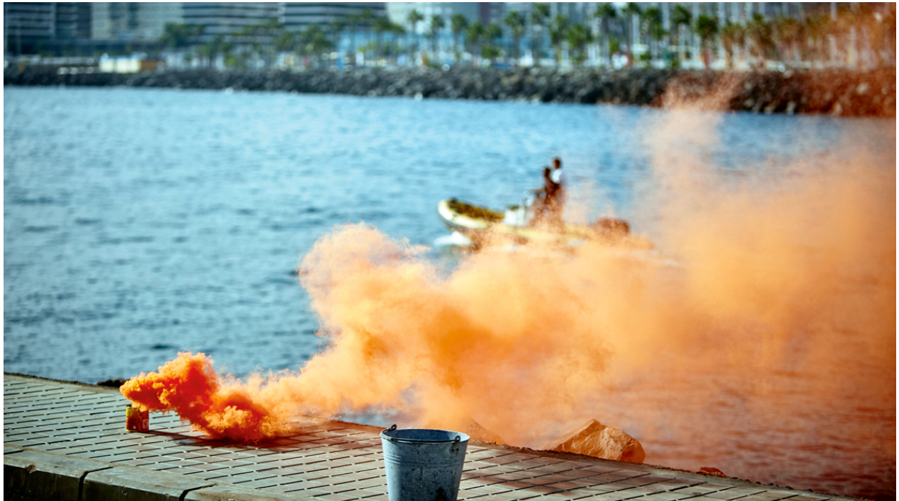
Orange smoke flare test during the ARC safety demo at Las Palmas.

All professional ship crew, at even the most basic level, get a chance to let off a flare during training.