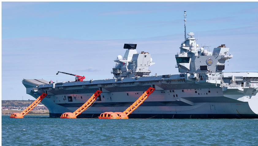
Safety training aboard the Royal Navy's Queen Elizabeth class aircraft carriers. Photo:

For me the only flares I plan to have in the future are the trousers hanging in my wardrobe. My wife wants me to get rid of them however – she reckons they're out of date too!