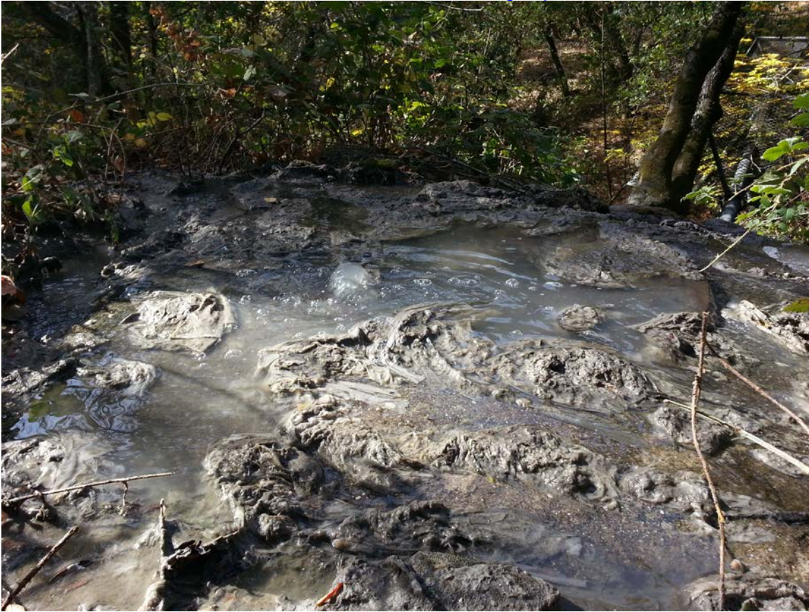
Sanitary Sewer Overflow caused by wipes blockage in Northern California

For more information about wipes and the problems that they cause, please visit www.casaweb.org/wipes