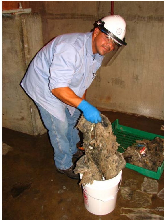
Workers demonstrate the daily maintenance issues with wipers at their treatment plants